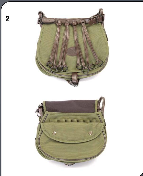
2 Article number: 3000073 Hunter-Bag packaging unit 15 pcs. Size approx.: 27 x 28 x 12 cm, hunter green

Traditional hunter-bag / game-bag made from hard-wearing 900D-Polyester-Nylon with internal large pockets for rounds of shot shells. Adjustable shoulder belt, detachable fowl-belt.