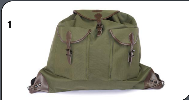
1 Article number: 3000071 Hunter-Backpack packaging unit 30 pcs. Size: approx. 63 x 52 cm, hunter green

A very hard-wearing backpack model, made from 900D-Polyester-Nylon. Strong seams additionally strengthened by rivets. With detachable water-proof plastic-insert, large shoulder belts with comfortable shoulder pads, even for heavy weights. With two large external pockets.